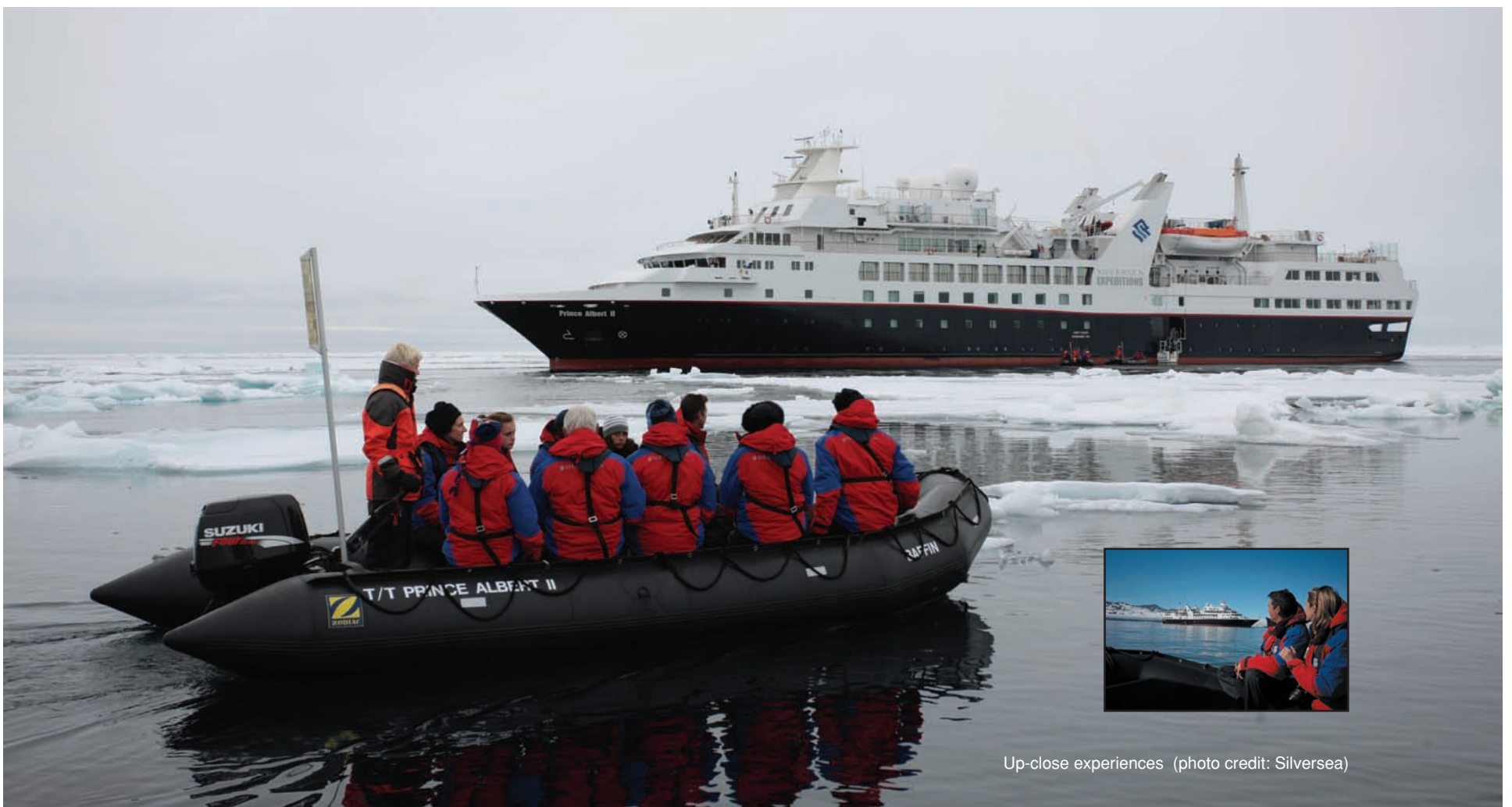
Up-close experiences